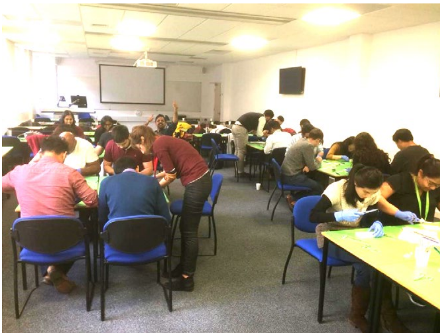
The Nottingham Surgical Skills Foundation Course