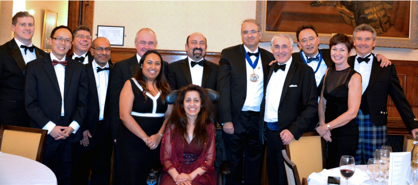
BASO Council and guests @ BASO Annual Gala Dinner